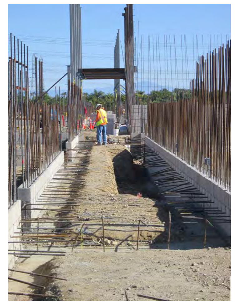
Bldg. F Corridor