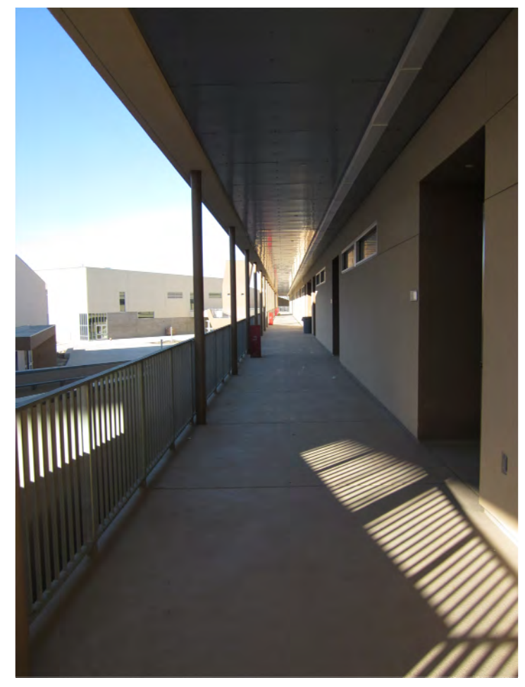
Bldg. C Corridor

Courtyard between Bldg. C and D Construction Progress Photos