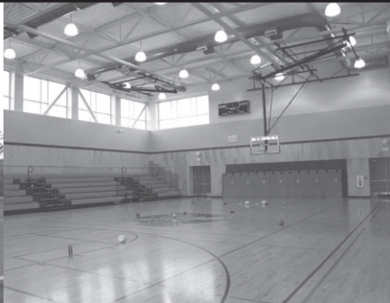
New Event Center at Lawson