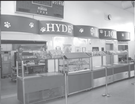
Upgraded Speed Lines at Hyde