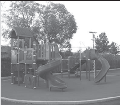
New Play Structure at Collins

The purpose of the $113 million in funds raised was to address the immediate and future facility needs of the Cupertino Union School District. Currently, $95 million of the funds has been used to modernize and renovate the district’s 25 school sites with the remaining $20 million earmarked for future projects. These funds can only be used for renovation and modernization of facilities and not for district operating costs.