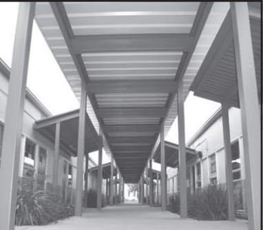
Renovated Corridor and Classrooms at Eaton

STATUS: Currently, the district is completing closeout procedures on the final construction phase that included: DeVargas, McAuliffe, Meyerholz and Muir Elementary Schools, as well as the Lawson Middle School conversion. The five schools opened their doors to students in August 2005, as planned. Your bond dollars allowed the district to upgrade each of our school sites to the standards that ensure that all of our students have a safe, secure place to learn. The total construction package of 25 schools that were modernized or renovated during the past three years were completed on time and within budget. If you have any questions, please contact the district’s liaison, Van Adams at (408) 252-3000, Extension 350, or by e-mail at adams_van@cupertino.k12.ca.us .